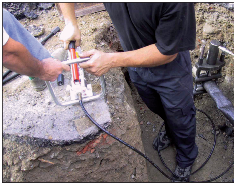
Pumping operation for pipe compressing